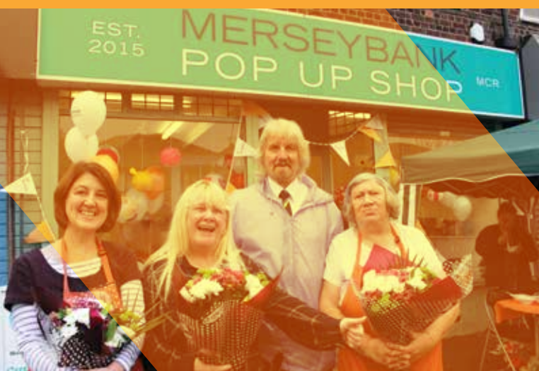
Our first food club in Chorlton , celebrated its first year anniversary (October 2016)