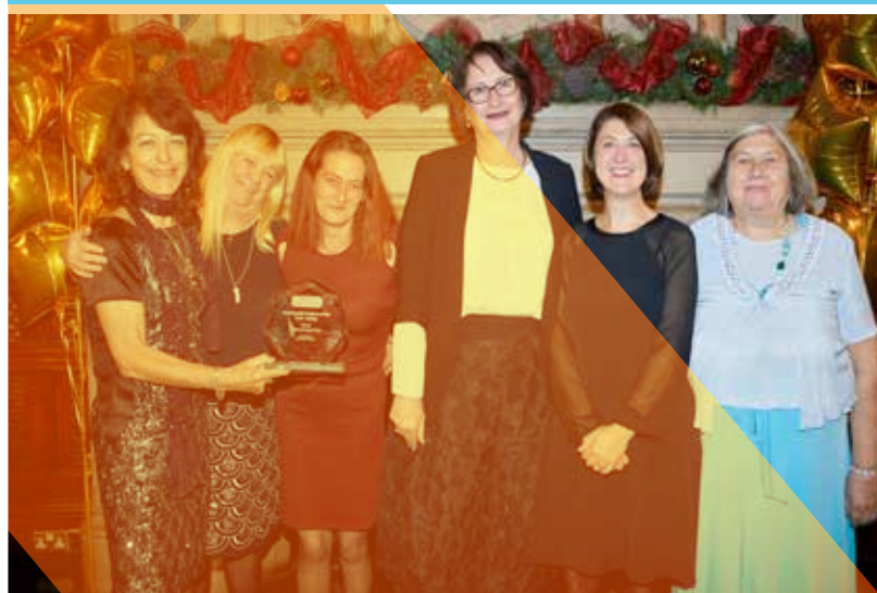
Finalists in Manchester's 'Be Proud' awards