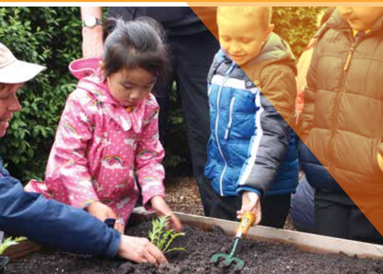
Children being educated about the food they eat.