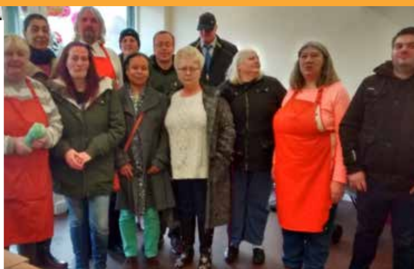
Project run by dedicated team of volunteers and Barlow Moor Community Association .